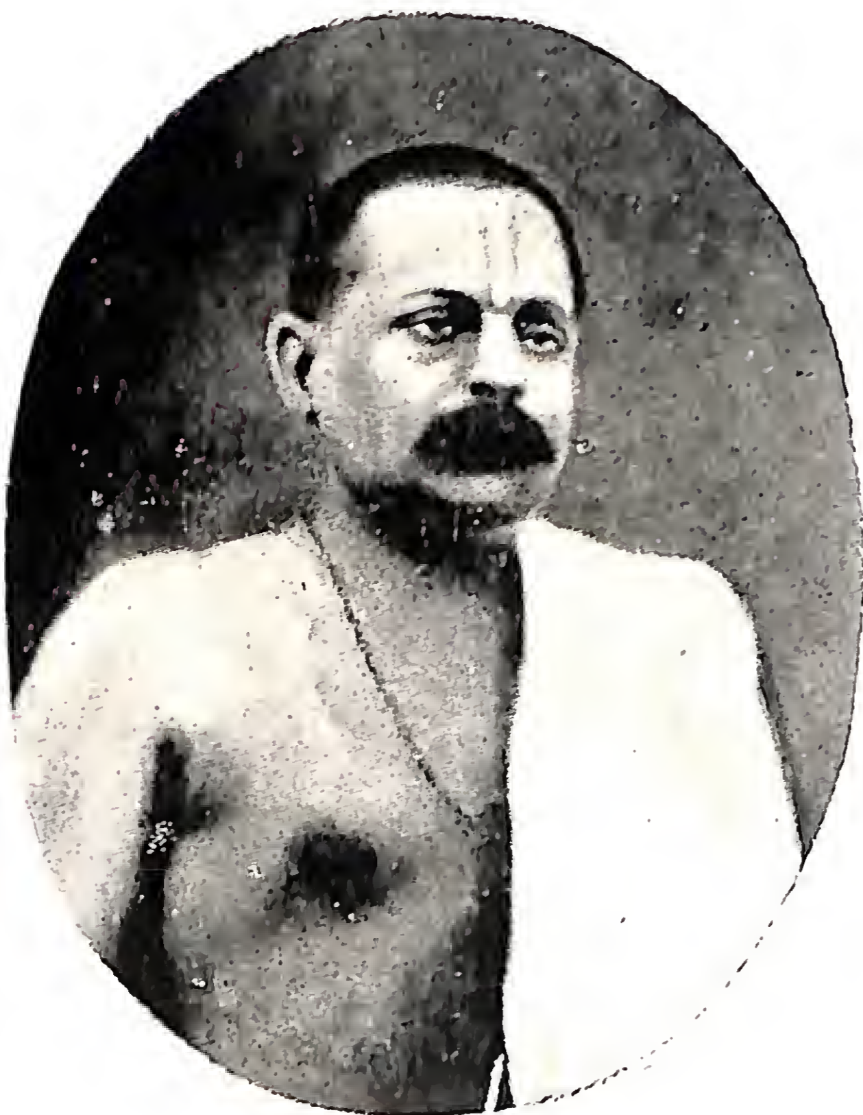
Goswami Shri Aniruddhacharya See Page 347